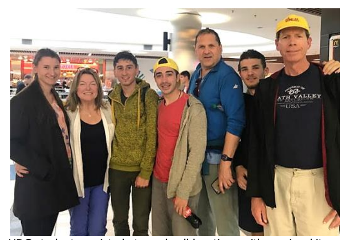
UDG students assisted at nearly all locations with music, skits

STO members distributed tee shirts with a message in Romanian from Isa 41, and hats printed with the "Save the Orphans" logo, as well as anti-trafficking pamphlets, fruits, sweets, and nuts.