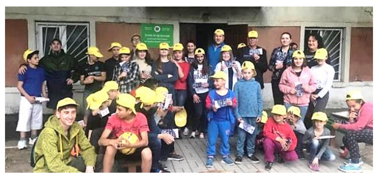
Children from the Straseni orphanage with the STO team at right rear.