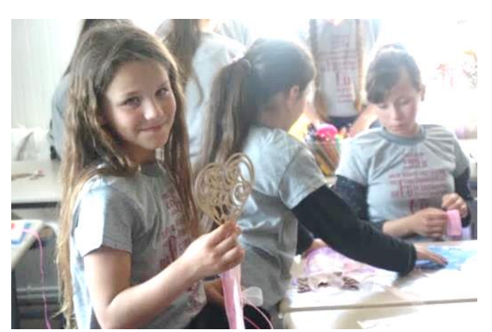
A girl from the village displays a heart she made.