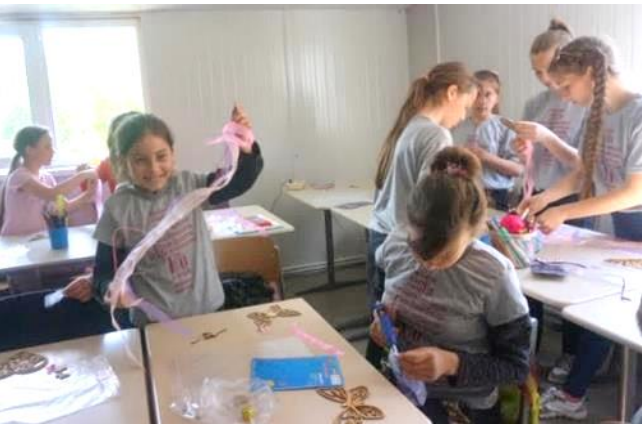
Children enjoy arts and crafts time after the message.