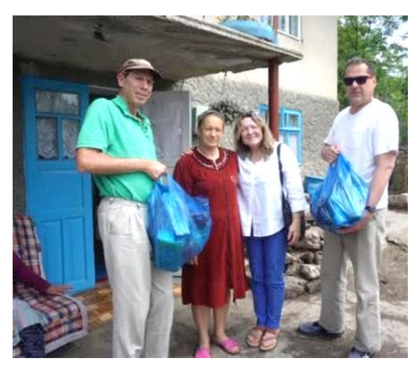
The mother here (second from left), a shepherd, has 11 children